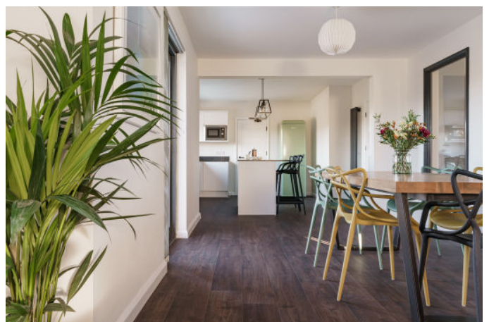
Yewbecks kitchen with breakfast bar and a dining area