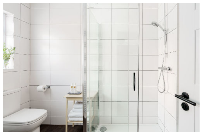
Ensuite to bedroom 2 with walk in shower