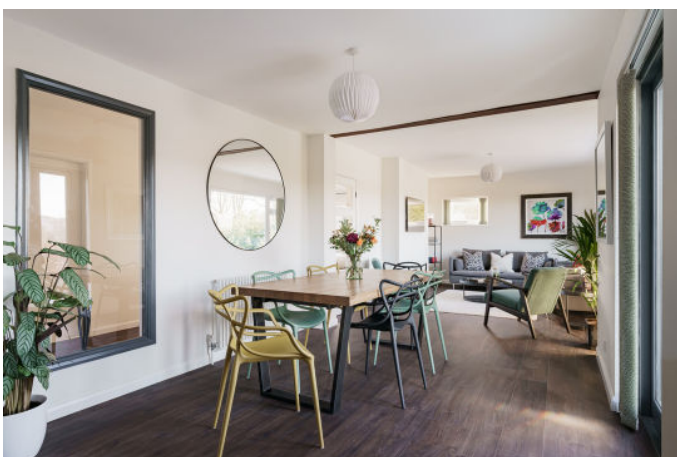
Yewbecks open plan dining /sitting area